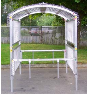
Cage fully assembled