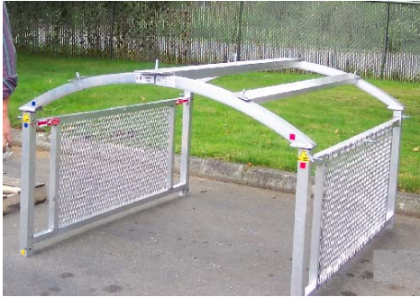
Attach wide truss connector to the middle of the arch and narrow truss connectors to each side of curved truss.