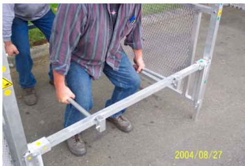
Handles should fold to the inside of the cage for carrying.