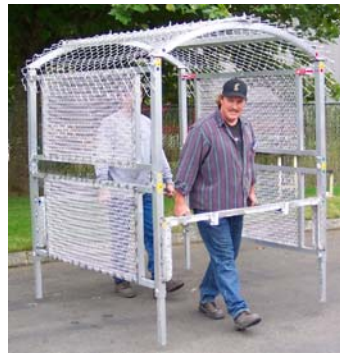
Carrying the Cage