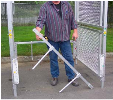
Connect combo safety bar and lifting handles.