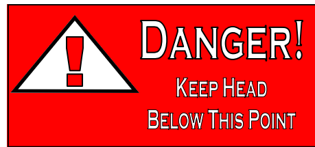
DANGER! Keep head below this point