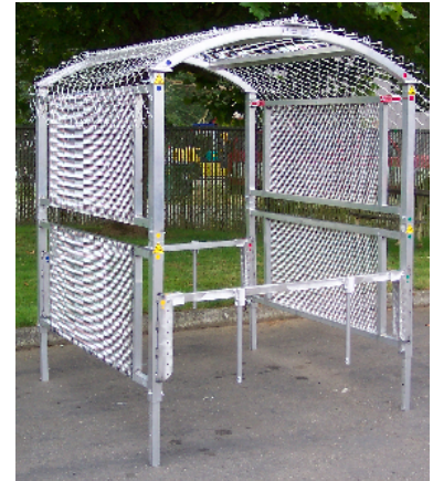
Fully assembled Cage