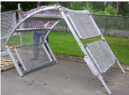
Connect the lower panels to the upper panels.