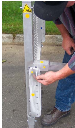
Insert bolts on each side