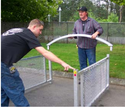
Attach arch to upper side panels