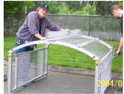
Roll the wire mesh over the top of the truss.