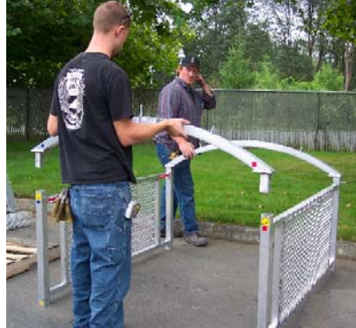
Components are color coded