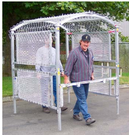
To disassemble reverse the assembly guide.

If any of the parts are damaged in shipment or on the job they must be replaced to secure the integrity of the cage.