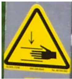
WARNING: Pinch point