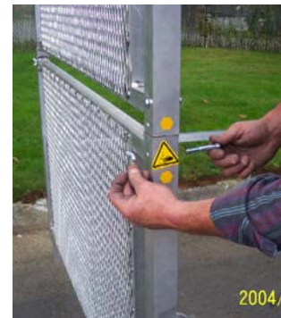
Insert bolts on each side

For comments, questions, or technical support call: